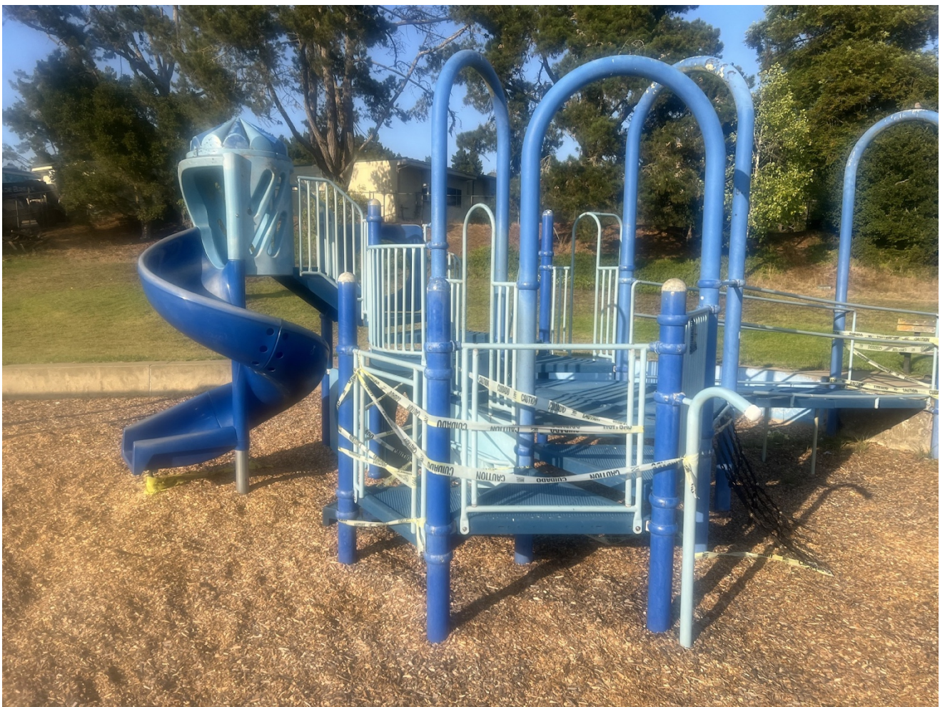
Rio Del Mar Park today

But now, the swings have been removed and the playground caution-taped off because the structure is too dangerous to play on. Instead of kids playing after school and parents catching up, families head straight home.