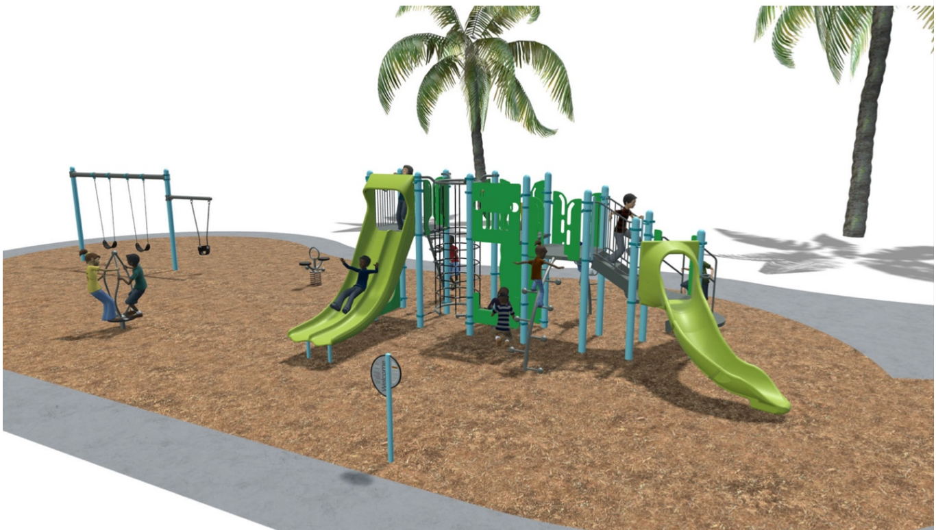
An example of what the new play structure might look like.